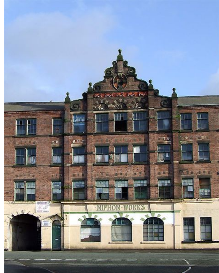
The place you worked in probably looked a lot like this