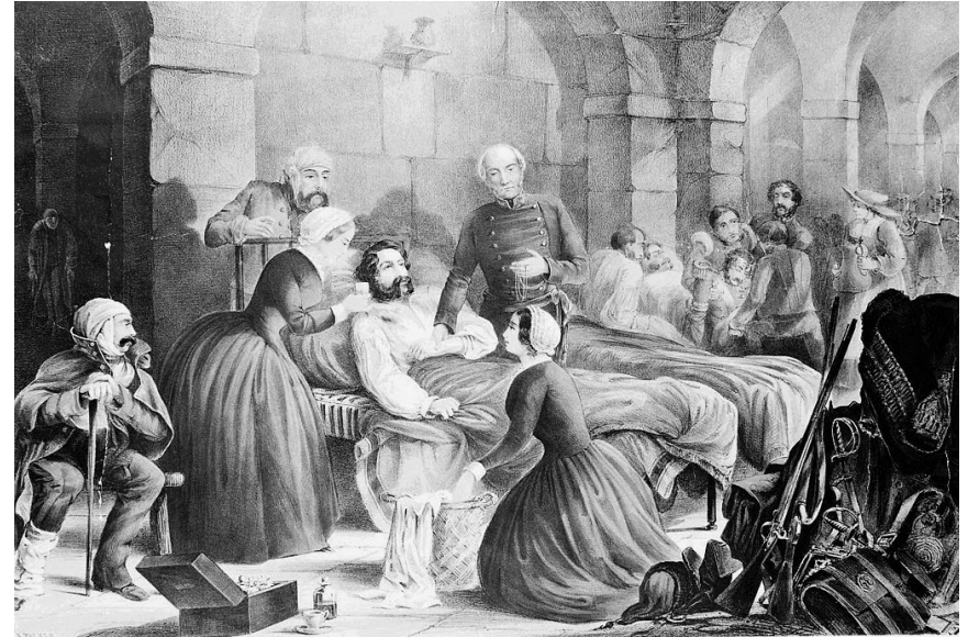
THE GREAT MILITARY HOSPITAL AT SCUTARI.