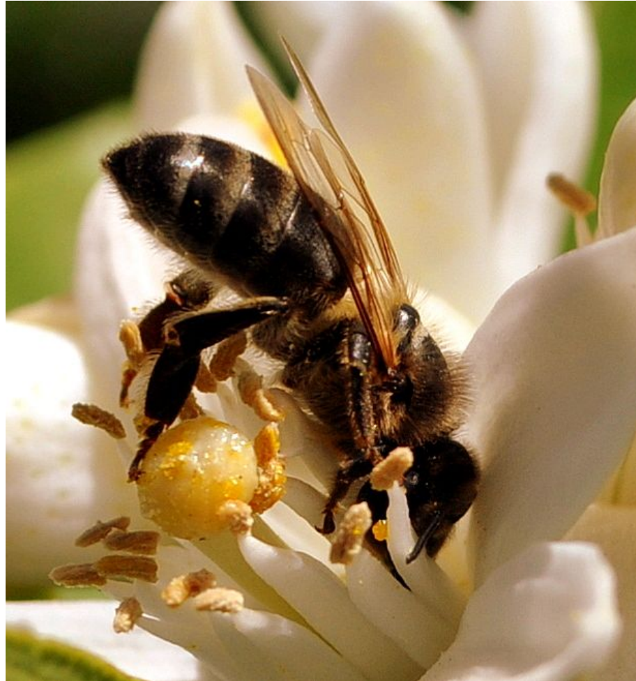
Bee pollinating flower