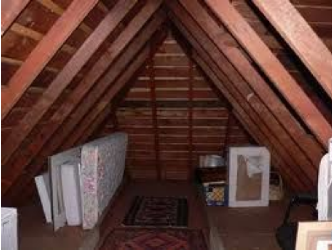
Hiding Stemmy in the attic