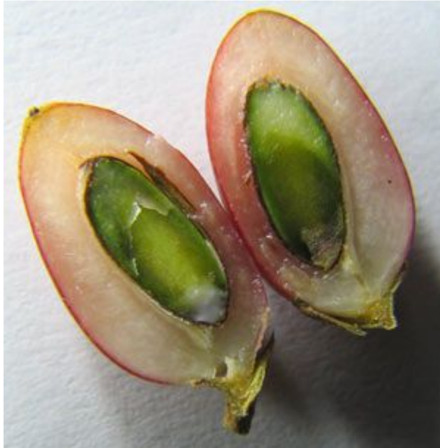
Seed in Popa Tree's fruit