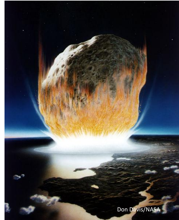
Asteroid hitting Earth