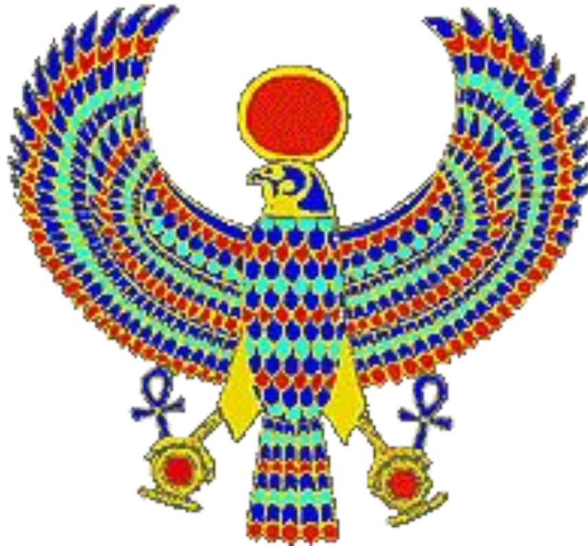
Hieroglyph of the Sun God Ra

You are about to see six different images. Arrange them into the correct order according to the story you just experienced.