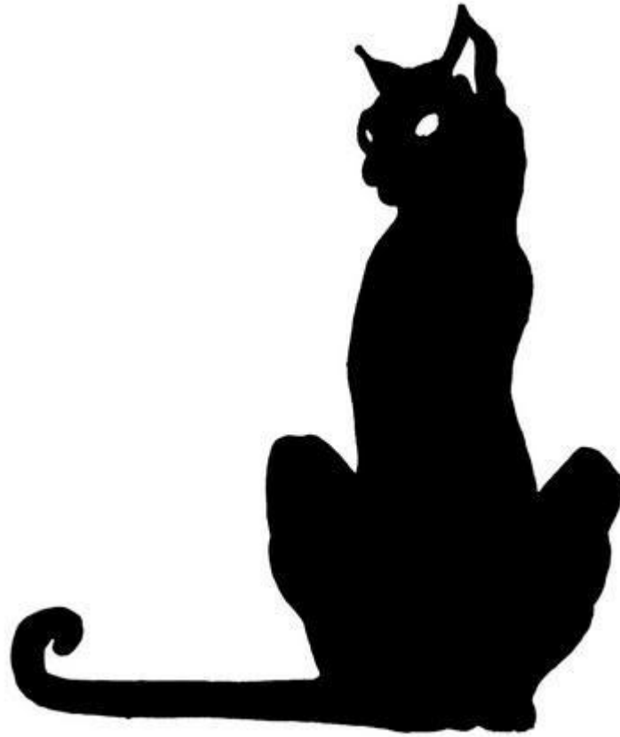
A black cat