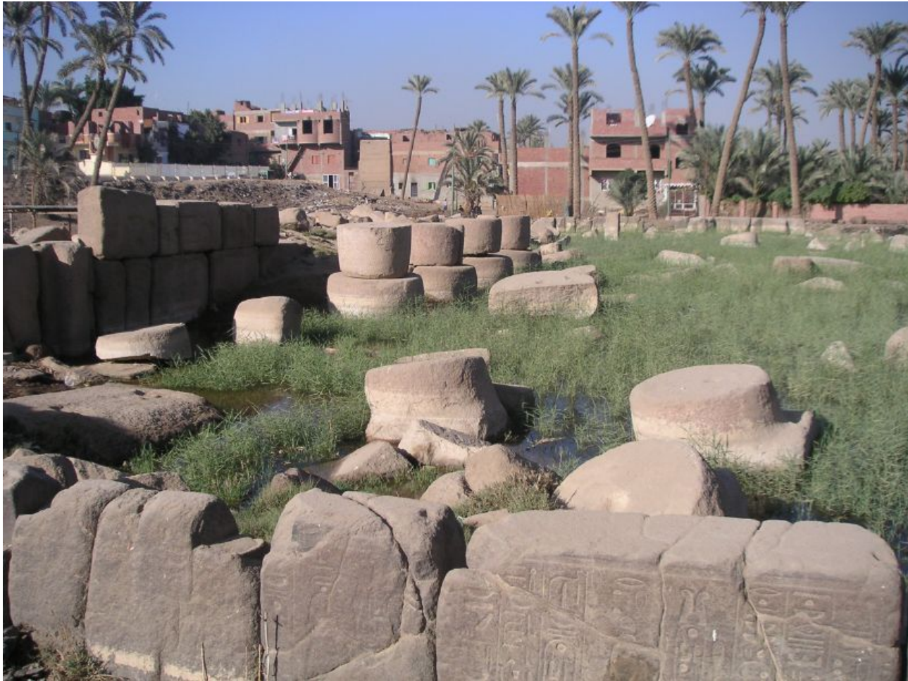
Ruins of Memphis