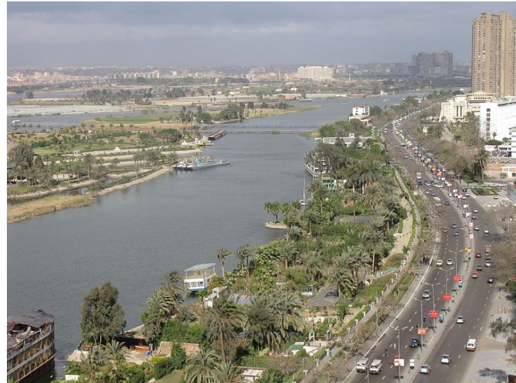
The river you travelled down today